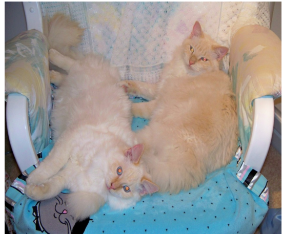
Yoshi and Sparkle

CHECK OUT OUR WEBSITE FOR CURRENT INFORMATION AT www.humanesocietyall.com